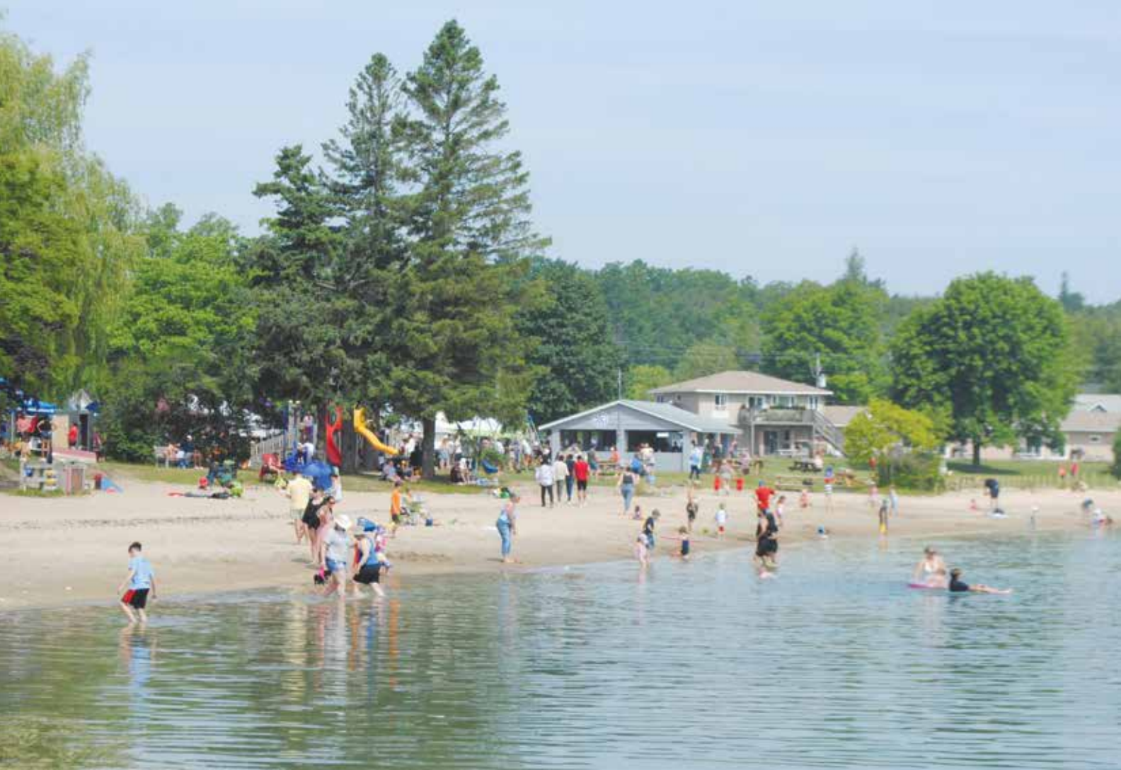
▲ Lion's Head has a lovely sandy beach close to the centre of town.