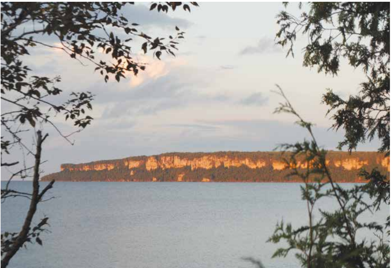
▲ The shape of a lion's head is thought to be visible in the Escarpment cliffs across the bay, giving the village its name. This view is from the Bruce Trail just north of town.