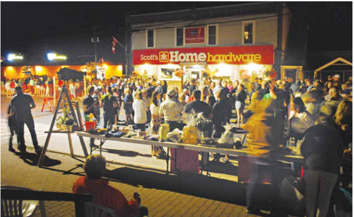
▲ The August Civic Holiday weekend street party draws a good crowd for great music, food, dancing and fun for all ages.