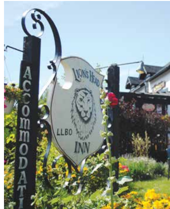
▲ The restaurant part of Lion's Head Inn has closed, but there will be more options for accommodation.