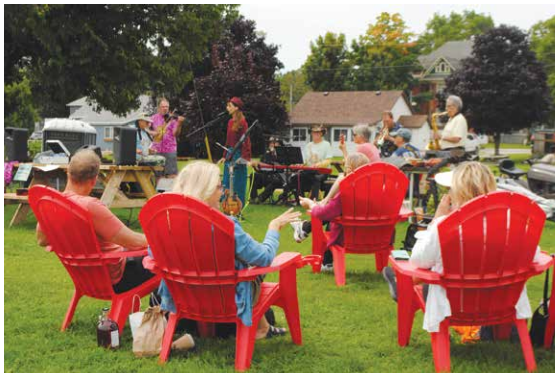
▲ Local musicians provide free entertainment at Lion's Head Farmers' Market on Saturday mornings throughout the summer.