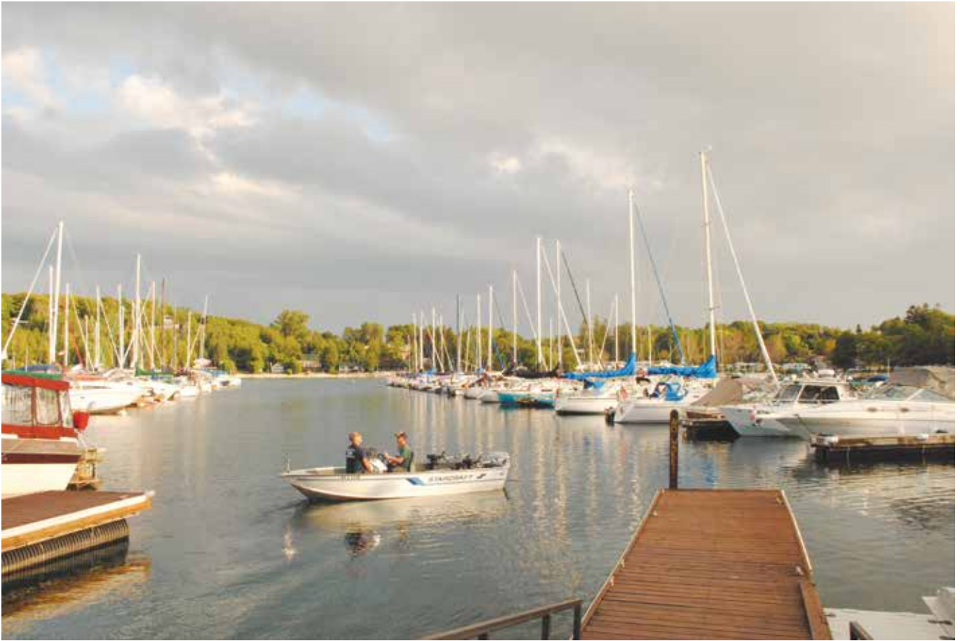
▲ Popular for sailing, power boating, and fishing, Lion's Head Harbour has been described as the prettiest marina in Ontario.